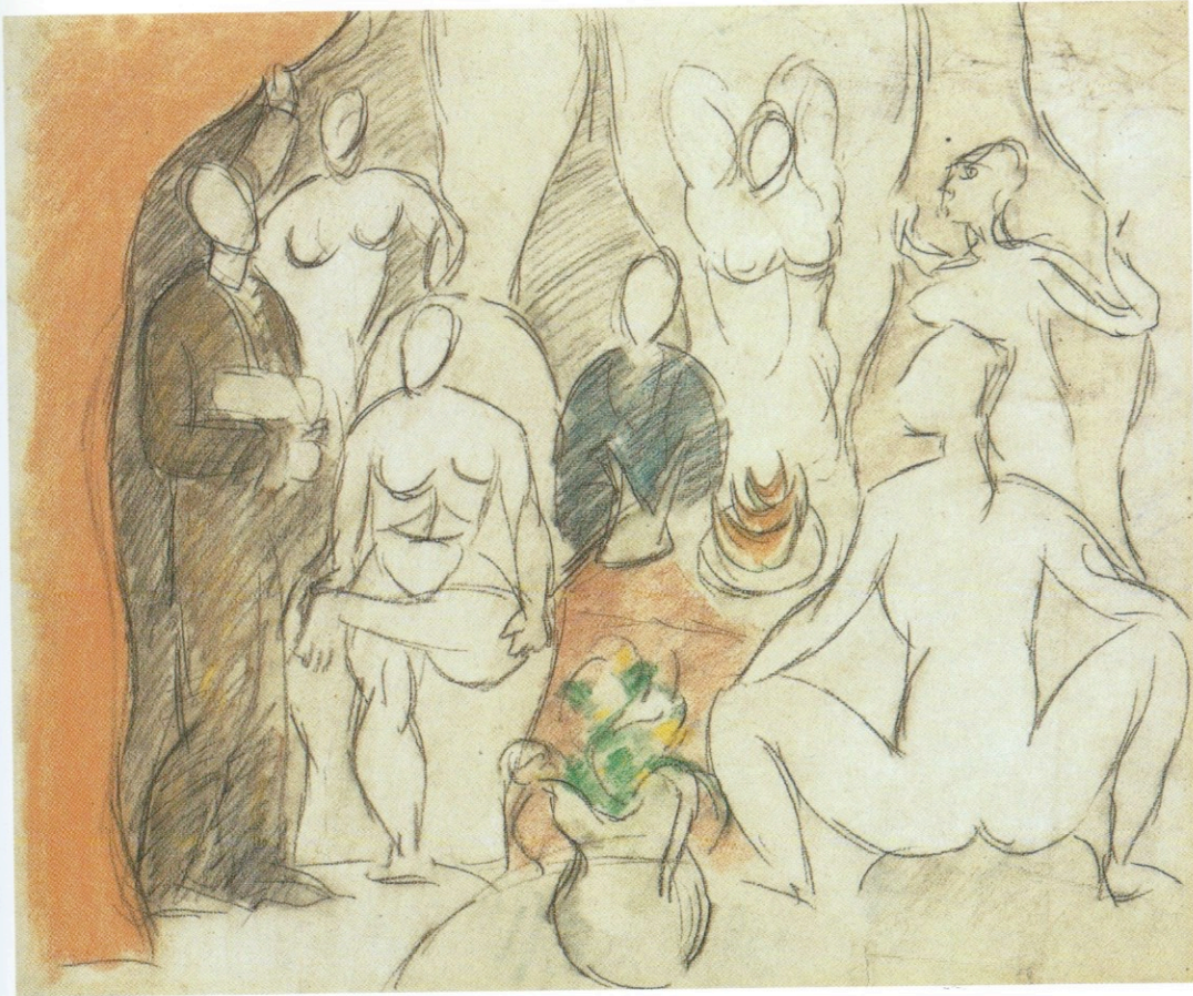
3 • Pablo Picasso, Medical Student, Sailor, and Five Nudes in a Bordello (composition study for Les Femmes d'Alger ), March–April 1907. Crayon drawing, 47.6 x 76.2 (18 \frac{3}{4} x 30)