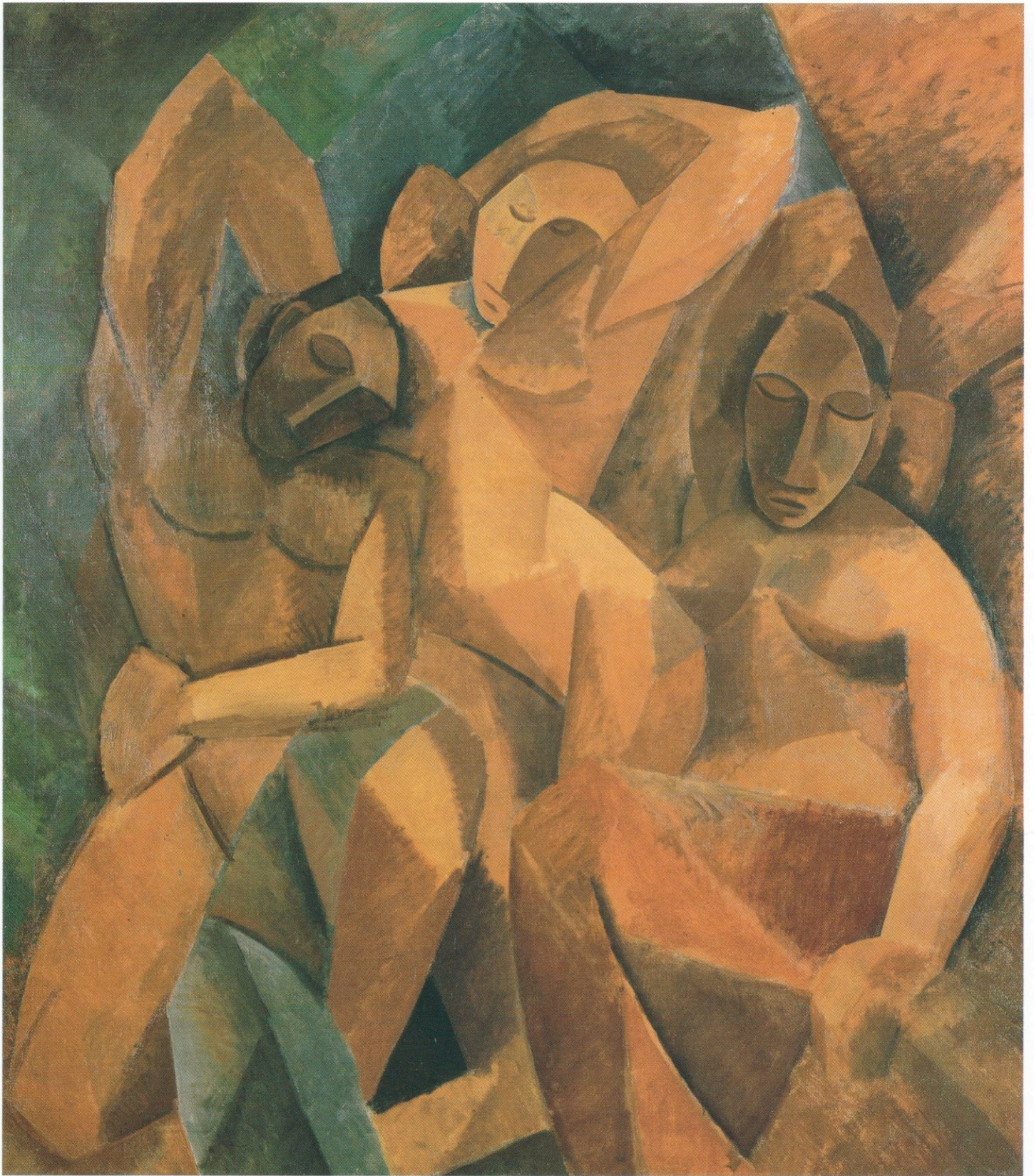
7 • Pablo Picasso, Three Women , 1908 Oil on canvas, 200 x 178 (78¾ x 70¼)