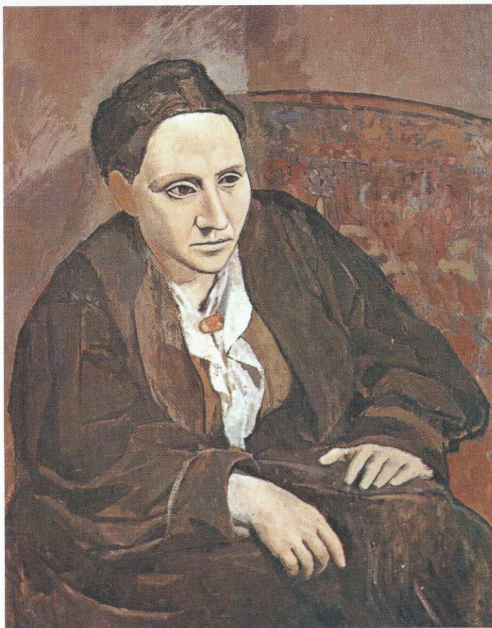
2 • Pablo Picasso, Portrait of Gertrude Stein , late summer 1906 Oil on canvas, 100 x 81.3 (39% x 32)